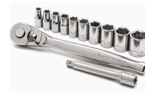
Sockets #6 & #10